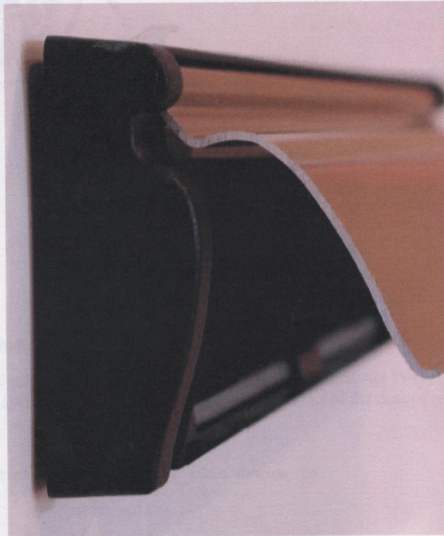
PERSPECTIVE VIEW OF ONE END OF ONE SIDE WITH FLAP OPEN